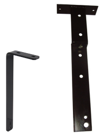
12" 20 - 36"